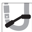
CA3510 KYP OVAL