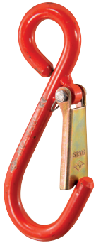
Tipo G1 G1 Type